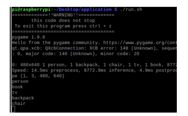
Fig. 7 Identified objects