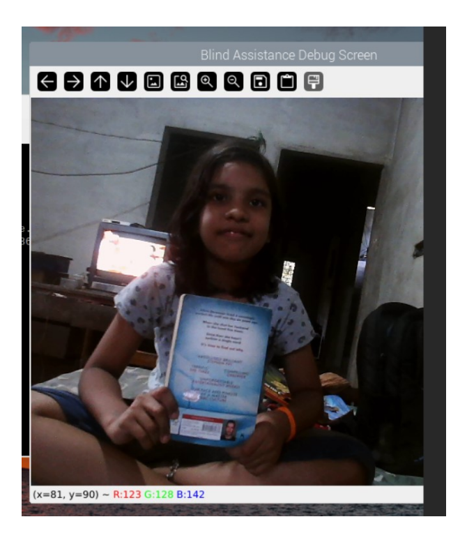
Fig. 6 Input image for object detection